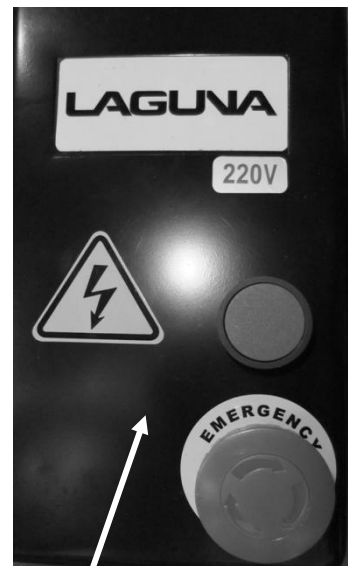
Dust collector control box

5. Once all the remotes have been set, Press the reset button on the control box. This stops the learning mode and the dust collector is ready to accept commands from the remote control /s